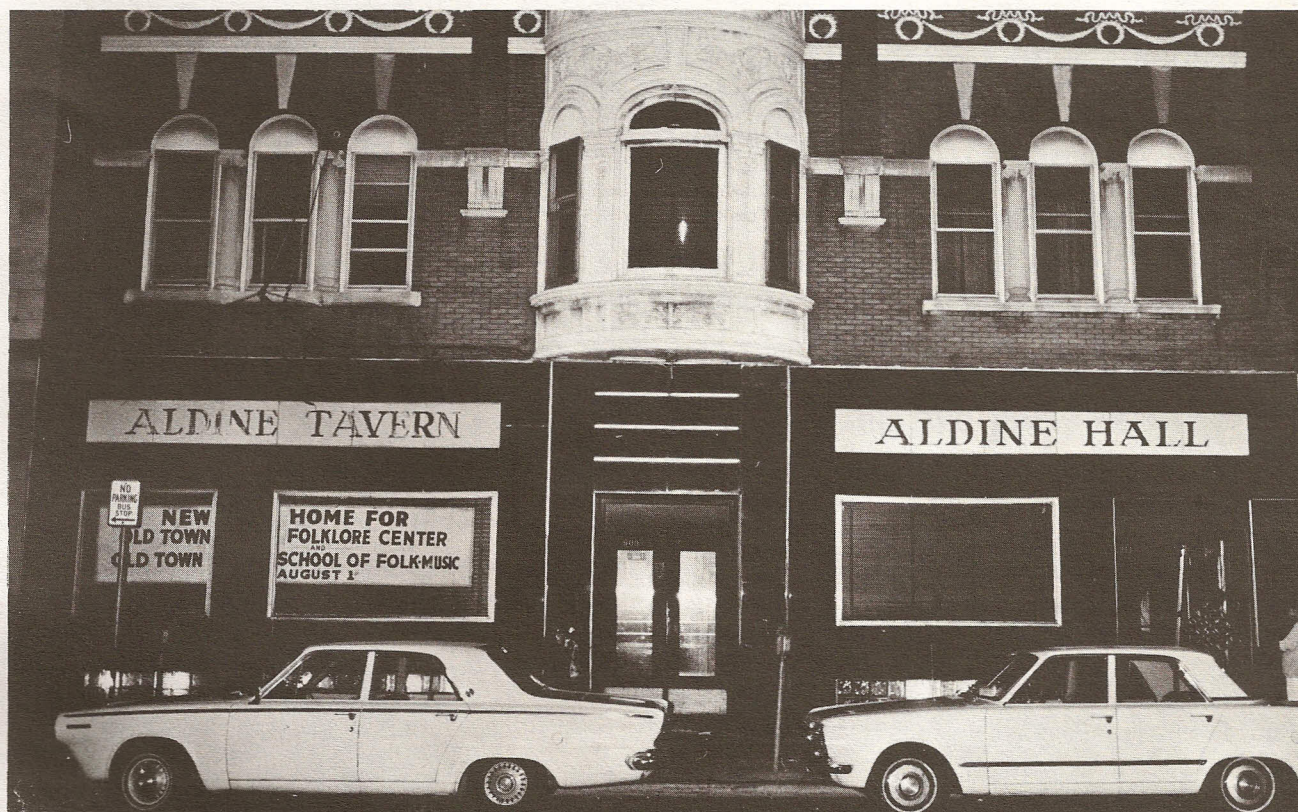
909 W Armitage, August 1968